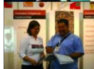
Australian Indigenous HealthInfoNet-Internet Café