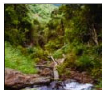
Widening the 'thin edge of the wedge', New Zealand