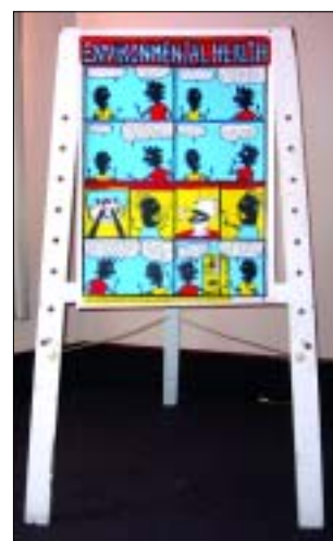
Storyboard poster presentations