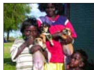
Animal Management in Rural and Remote Indigenous Communities (AMRRIC)