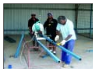
Murdi Paaki healthy housing workers