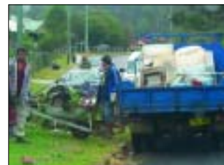
Empowering Indigenous communities