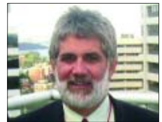
Ken Wyatt, Director Aboriginal Health, NSW Health