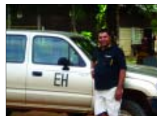
Indigenous Environmental Health keeps moving ahead in QLD