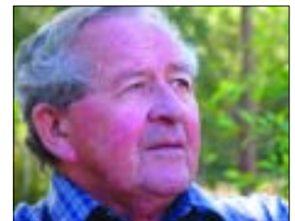
Hal Wootten AC QC