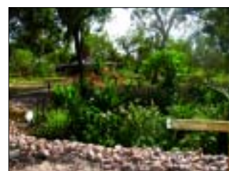
Wastewater Gardens™ project at Emu Creek