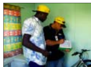
Environmental health workforce development