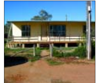
Housing issues and planning