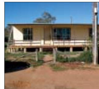
Housing issues and planning