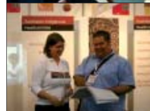
Australian Indigenous HealthInfoNet-Internet Café