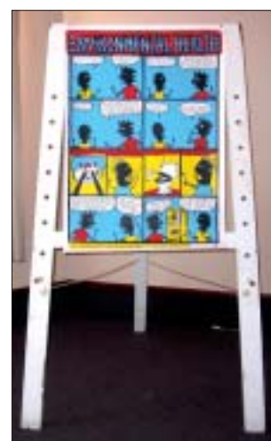
Storyboard poster presentations