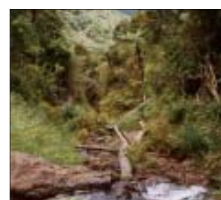
Widening the 'thin edge of the wedge', New Zealand