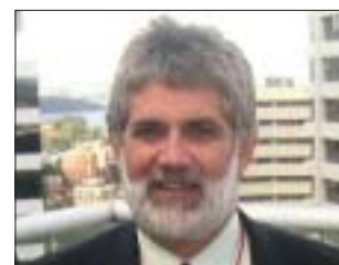
Ken Wyatt, Director Aboriginal Health, NSW Health