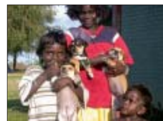
Animal Management in Rural and Remote Indigenous Communities (AMRRIC)