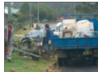
Empowering indigenous communities