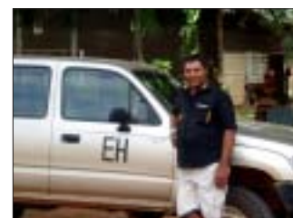
Indigenous Environmental Health keeps moving ahead in Qld