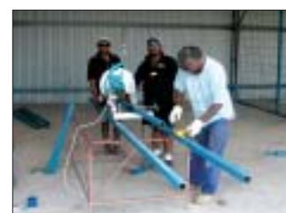
Murdi Paaki healthy housing workers