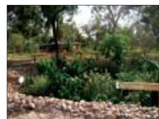
Wastewater Gardens™ project at Emu Creek