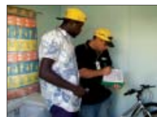
Environmental health workforce development