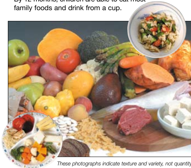
These photographs indicate texture and variety, not quantity.

By 12 months, children are able to eat most family foods and drink from a cup.