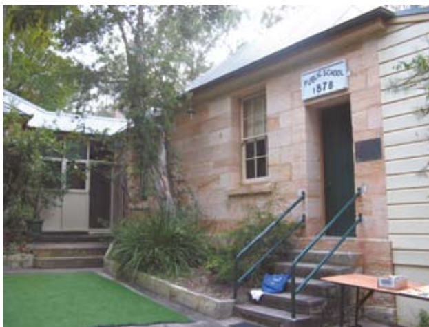
Original Brewongle School Building circa 1878

To ensure that students and parents were fully aware of the code of behaviour expected at KATCH, a list of 'rules and student responsibilities' was drawn up and included in application packs for students and parents to consider and sign.