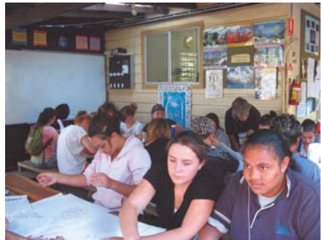
Working on artistic expression

Some responses indicated empathy with the presenters' lives and stories: