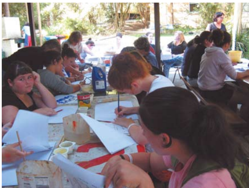
Students and their artwork – putting their experiences on canvas