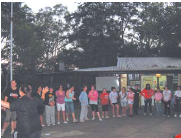
Learning the dance

Responses to questions about the planning of KATCH included satisfaction with the planning and organisation processes as they were “collegial, inclusive and participatory and the lessons from this project will improve any future planning”. The venue was considered appropriate