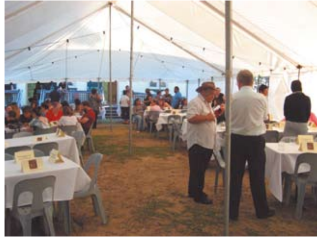
Preparing the Marquee for dinner