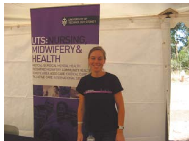
More from the Mini Expo: University of Technology Sydney (UTS) Nursing, Midwifery & Health

Suggestions for future events included the need for more support from regional DET teams especially from those that had students attending; roles and responsibilities at the workshop need to be clarified; ensure presentations are kept to time so others are not cut short; and more community and student involvement in the planning stages.