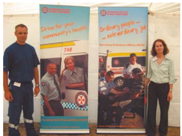
Ambulance Officers at the Mini Expo