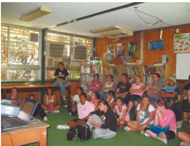
A very attentive audience.