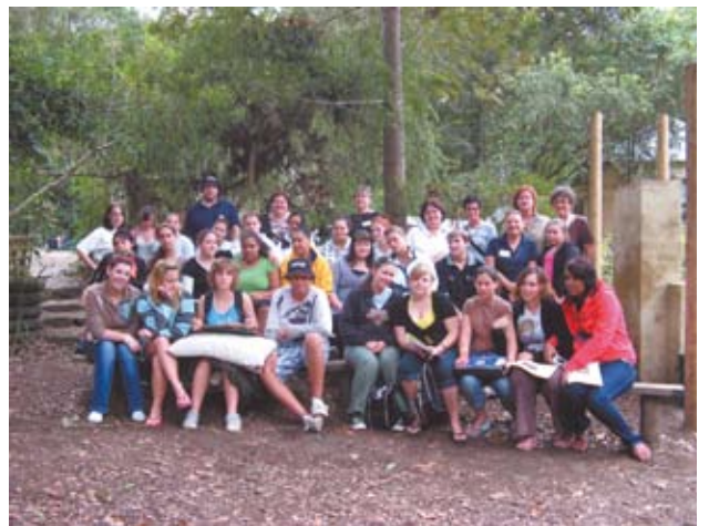
One last group photo before goodbye!