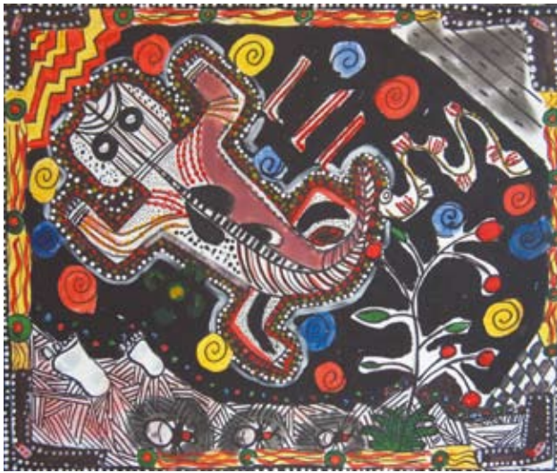
This painting from Airds High School tells of the great things at KATCH