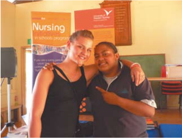
Students at the KATCH Mini Expo