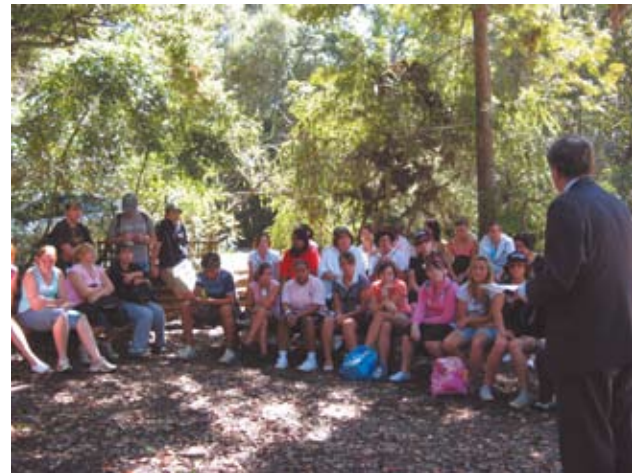
Minister Lynch addressing the students