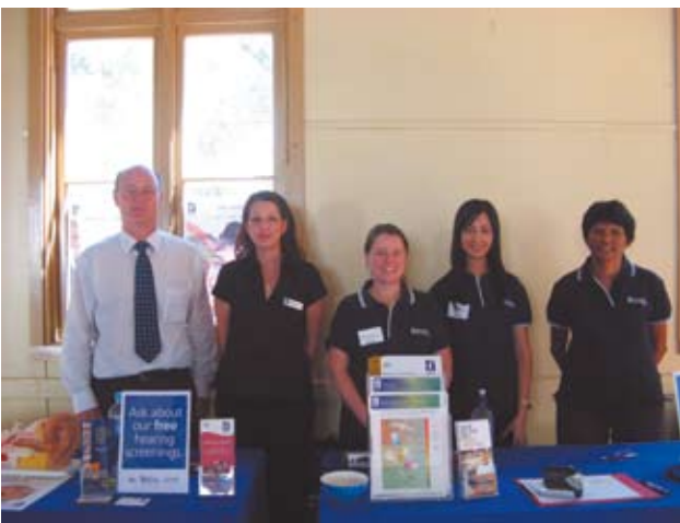
Australian Hearing Services