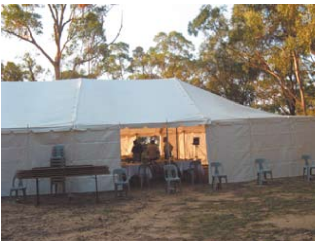
Preparing the Marquee for dinner