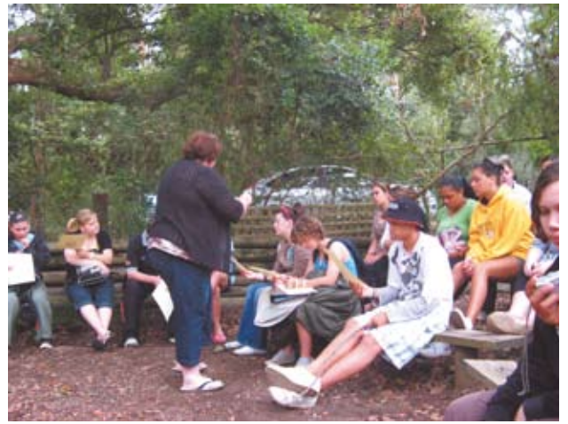
Presentation of Certificates