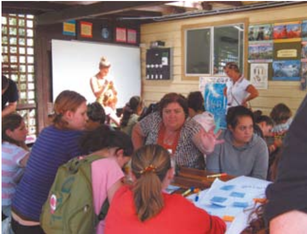
Hard at work having fun with paint!