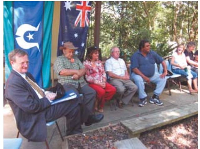
The Hon Paul Lynch MP Minister for Local Government, Minister for Aboriginal Affairs, Minister Assisting the Minister for Health (Mental Health) with Daruk Elders at the opening of KATCH.

KATCH was officially opened with a welcome from local Aboriginal Elders and the Hon Paul Lynch MP Minister for Local Government, Minister for Aboriginal Affairs, Minister Assisting the Minister for Health (Mental Health).