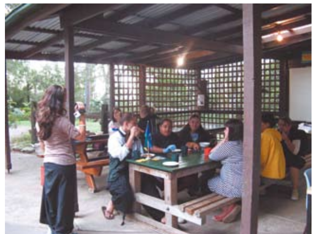
Students at work!

On Day 2 the 27 students were given the opportunity of having their photo taken against a background of the health profession that most interested them, for use as a KATCH ID badge. Their career interests are listed on page 19 and compared with Day 4 when 16 of the 26 students provided their names and career interests for follow up contact at school with their career adviser and the Nurse Initiatives in Schools Manager.