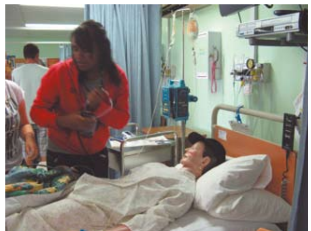
The UWS nursing laboratory