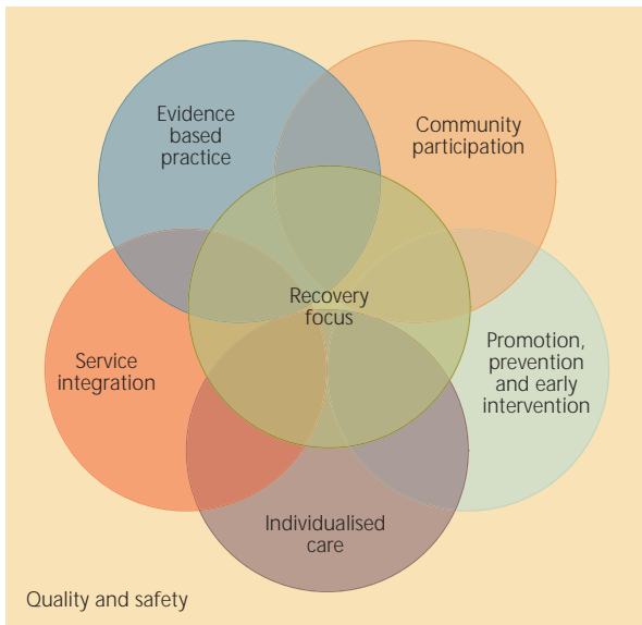
Principles of community mental health care diagram