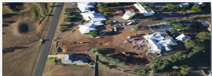
HealthOne Manilla construction site

HealthOne Pottsville – Construction has recently commenced for a purpose-built facility near the town's business and retail centre, close to the NSW/Queensland coastal border. Services will target older people, particularly those with chronic illness and children, young people and families.