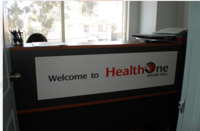
HealthOne Rouse Hill

HealthOne NSW NEWS will be distributed electronically. If you have been given or sent this copy by someone else and would like to subscribe in your own right, please send an email to healthonensw@doh.health.nsw.gov.au