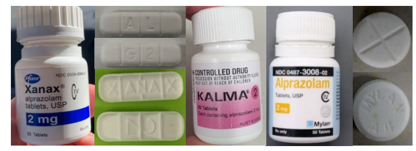
Figure 1 . Counterfeit alprazolam products reported by NSW Health clinicians. Note 'Kalma' is an Australian registered brand of alprazolam and it may be difficult to differentiate between legitimate and counterfeit products.

Novel benzodiazepines are being seen increasingly in toxicology testing of drugrelated hospitalisations. This Safety Information supersedes SI:006/22 and provides updates on the increasing variety of novel benzodiazepines and other substances detected in samples of counterfeit alprazolam, including multiple benzodiazepines in one tablet. Some tablets contain no benzodiazepines at all, so patients may potentially present in withdrawal, even whilst taking counterfeit alprazolam.