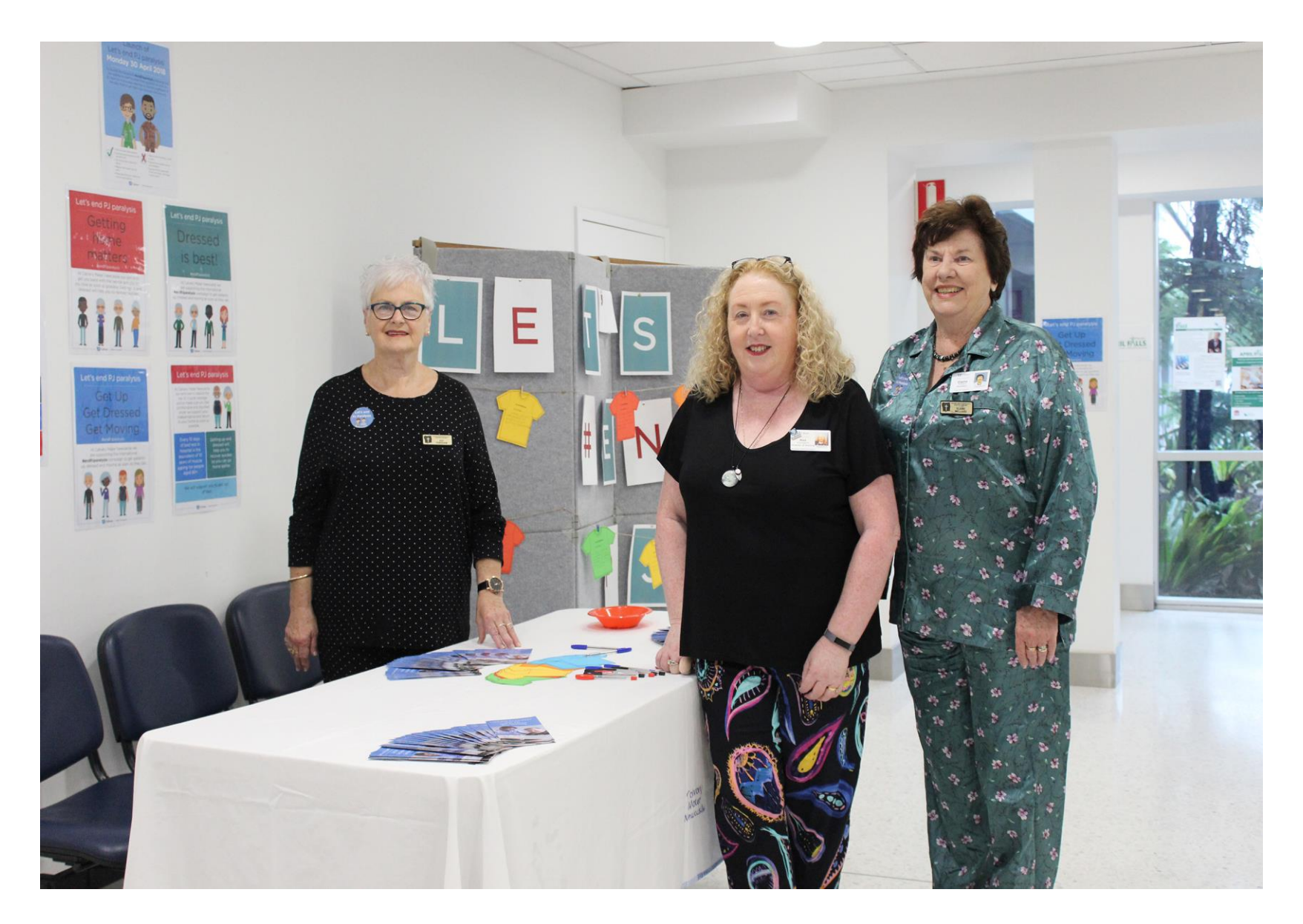
Continuing the Mission of the Sisters of the Little Company of Mary