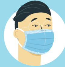
Cover your mouth, nose, and chin