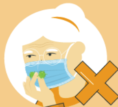
Do not touch the front of the mask