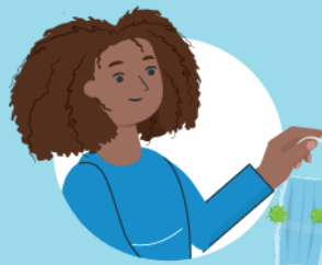
Keep the mask away from you and surfaces while removing it