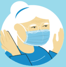
Avoid touching the mask