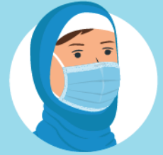
Adjust the mask to your face without leaving gaps on the sides