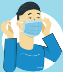
Remove the mask from behind the ears or head