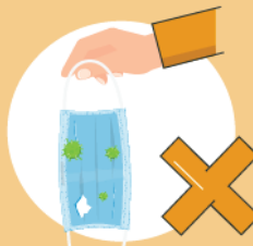
Do not use a ripped or damp mask