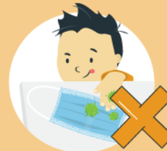
Do not leave your used mask within the reach of others