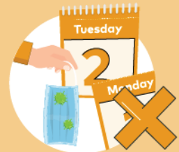
Do not re-use the mask

Remember that masks alone cannot protect you from COVID-19. Maintain at least 1.5m distance from others and wash your hands frequently and thoroughly, even while wearing a mask.