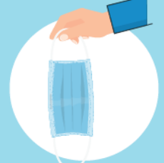
Inspect the mask for tears or holes