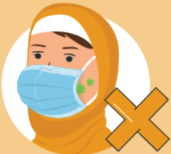
Do not wear a loose mask