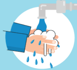
Wash your hands before touching the mask