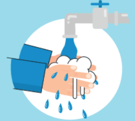
Wash your hands after discarding the mask