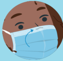
Place the metal piece or stiff edge over your nose