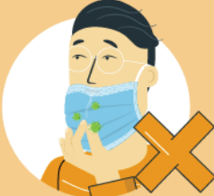
Do not remove the mask to talk to someone or do other things that would require touching the mask