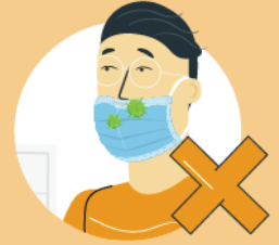
Do not wear the mask only over mouth or nose