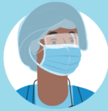
Ensure the colored-side faces outwards