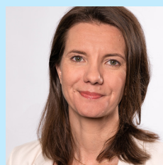
The Hon. Rose Jackson, MLC Minister for Mental Health