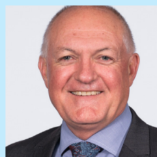
The Hon. David Harris, MP Minister for Medical Research

The Hon. Brad Hazzard MP held the office of the Minister for Health from 21 Dec 2021 to 28 March 2023.