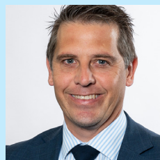
The Hon. Ryan Park, MP Minister for Health, Minister for Regional Health