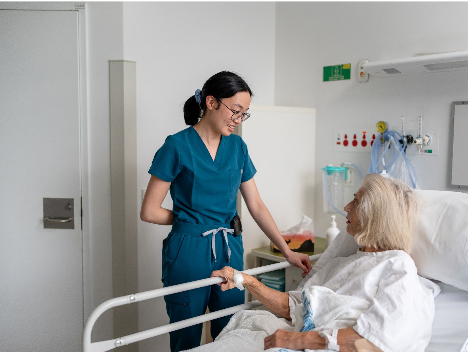
Liverpool Hospital - Tiffany

If you have not yet been paid a subsidy, you need to withdraw your application in myHETIconnect . Your circumstances will be assessed to determine if a repayment is required.