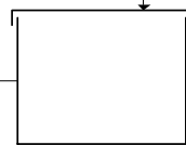
Rainwater Storage Tank