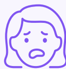
Anxiety, depression and isolation

It's normal to feel some anxiety about the big changes pregnancy brings to your life. While you may feel a bit up and down, for the most part you should feel like your normal self and enjoy social activities and interests.