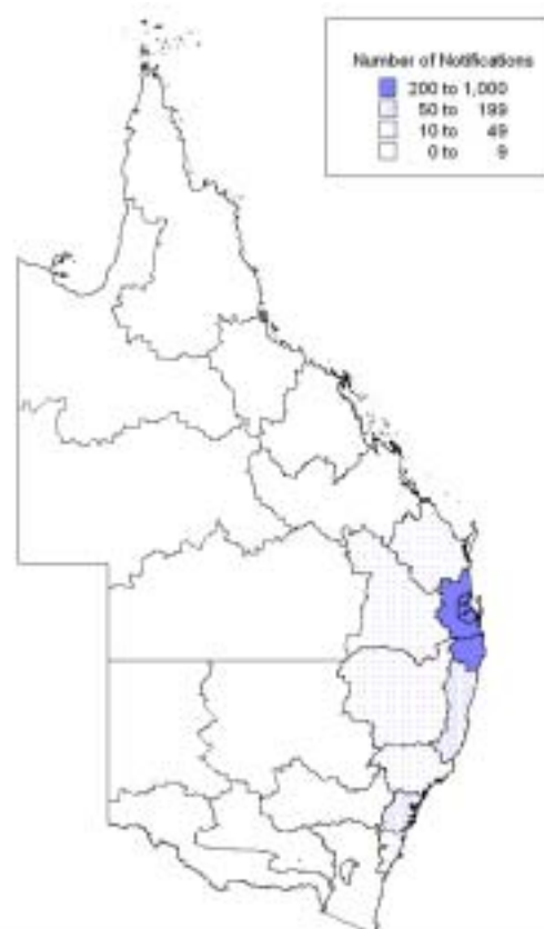
SALMONELLA BIRKENHEAD NOTIFICATIONS BY STATISTICAL SUBDIVISION, QUEENSLAND AND NSW, 1996-2002

Source: NSW Notifiable Diseases Database, NSW Health and Queensland Notifiable Conditions Surveillance System, Queensland Health