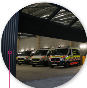
Bankstown Ambulance Superstation

At every step of the process there are a suite of expertly-skilled professional services firms that provide the project managers, architects and cost planners, among other specialists, who are critical to projects.