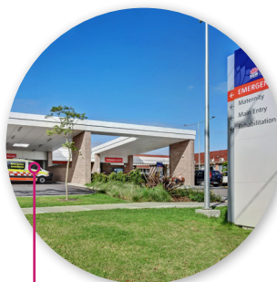
Kempsey District Hospital Redevelopment