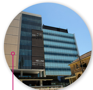
The Bright Alliance building, Randwick