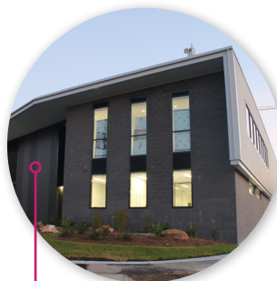
Kogarah Ambulance Superstation