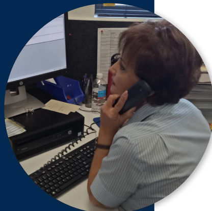
Photo: Unnecessary hospital visits were avoided by careful monitoring of calls involving residential aged care facilities.

The project received the Minister for Health Award for Innovation and was a finalist for Integrated Health Care at the NSW Health Awards.