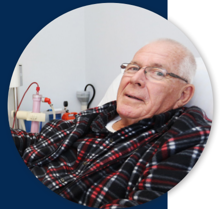
Photo: The My Home Hemo app supported patients undertaking haemodialysis at home.

Extensive work was also undertaken to improve the consistency and quality of Non-Admitted activity data. This included the Non-Admitted Reporting Project, which achieved gains in the reporting of data as well as developing guidance material to support consistency in reporting. This work enables better comparability of services provided to patients and greater equity in funding Non-Admitted activity on an Activity Based Funding basis.