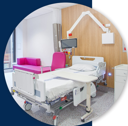
Photo: Facilities for carers in hospital rooms made life better for patients without affecting clinical care.

The project received the Caring for our Carers Award at the 2016 NSW Health Awards.