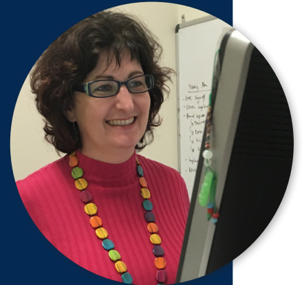
Photo: A variety of clinicians were able to create the Child At Risk Alerts to help protect children and women in danger.

The project received the Local Solutions Award at the 2016 NSW Health Awards.