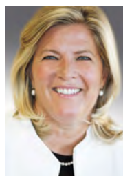
The Hon. Bronnie Taylor MLC Minister for Mental Health, Regional Youth and Women