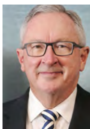
The Hon. Brad Hazzard MP Minister for Health and Medical Research