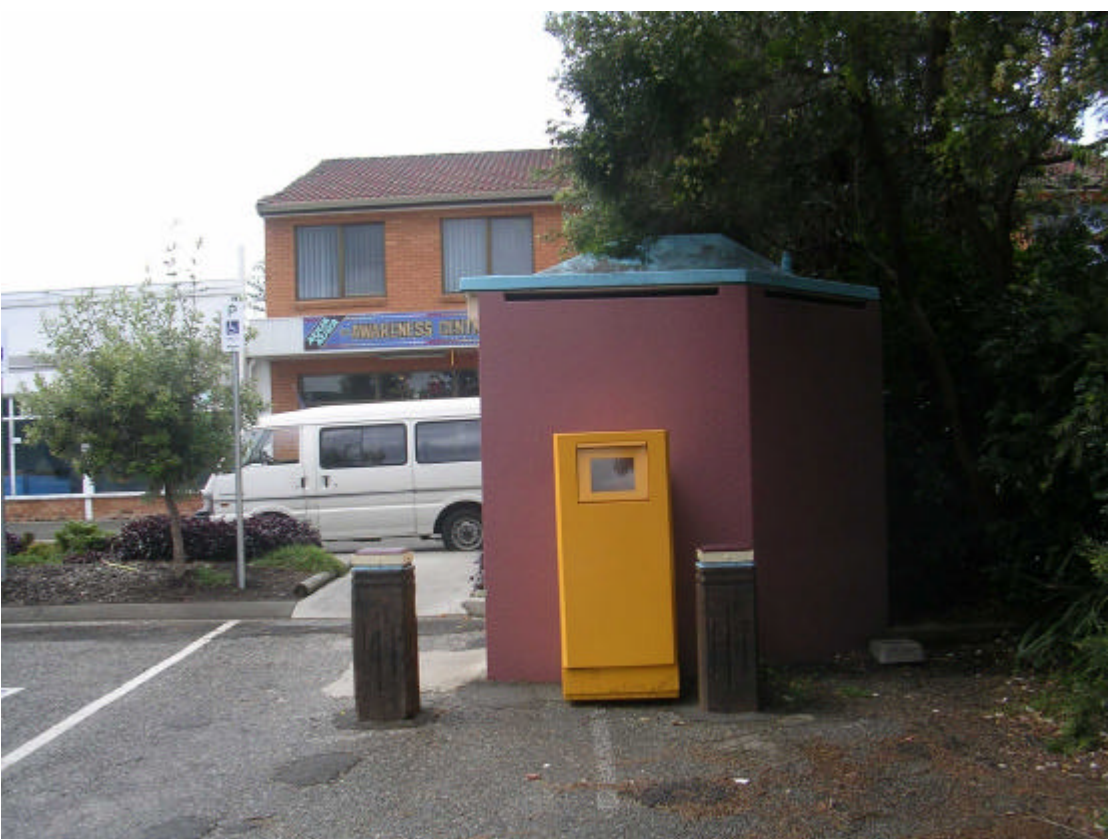
Community sharps bin installation at South West Rocks