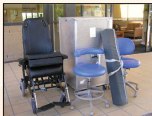
Portable dental equipment onsite at Koombahla Aged Care Facility.