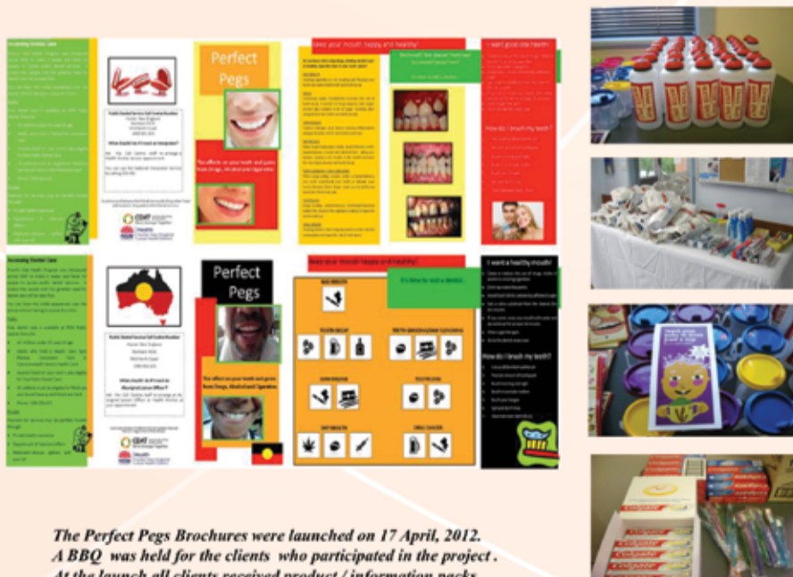
The Perfect Pegs Brochures were launched on 17 April, 2012. A BBQ was held for the clients who participated in the project. At the launch all clients received product / information packs.