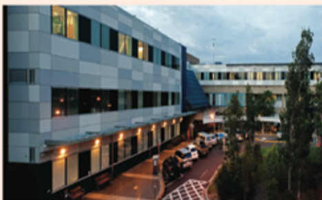
Westmead Hospital Main Entrance