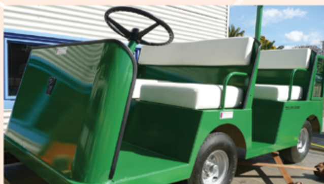
The arrival of the first Buggy, the Tourmaster