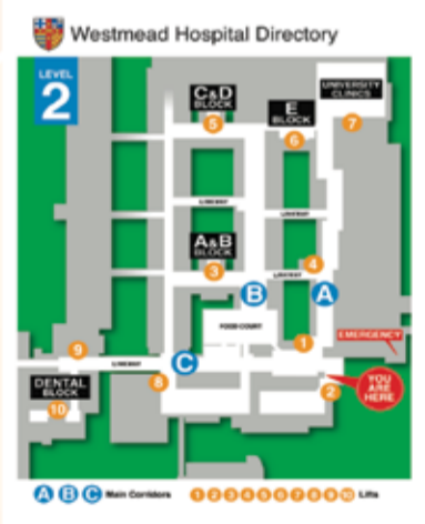
Map of Level 2 Buggy Routes