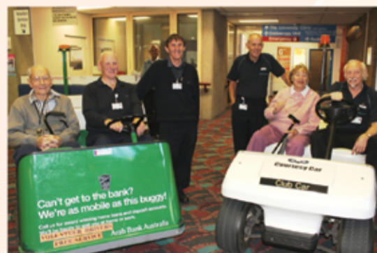
We now have two 3 seater Buggies completing more than 10,000 trips per year.