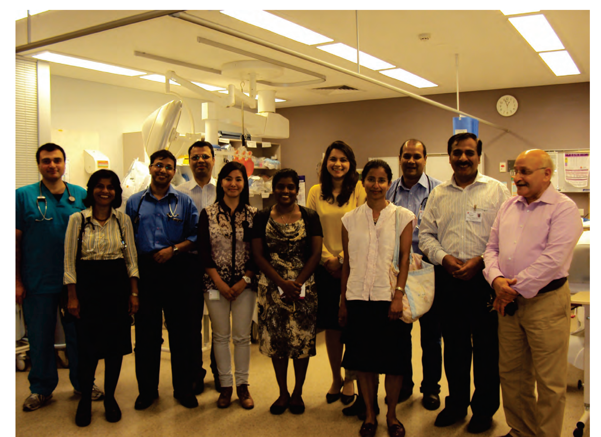
A few of the new doctors at Griffith Base Hospital