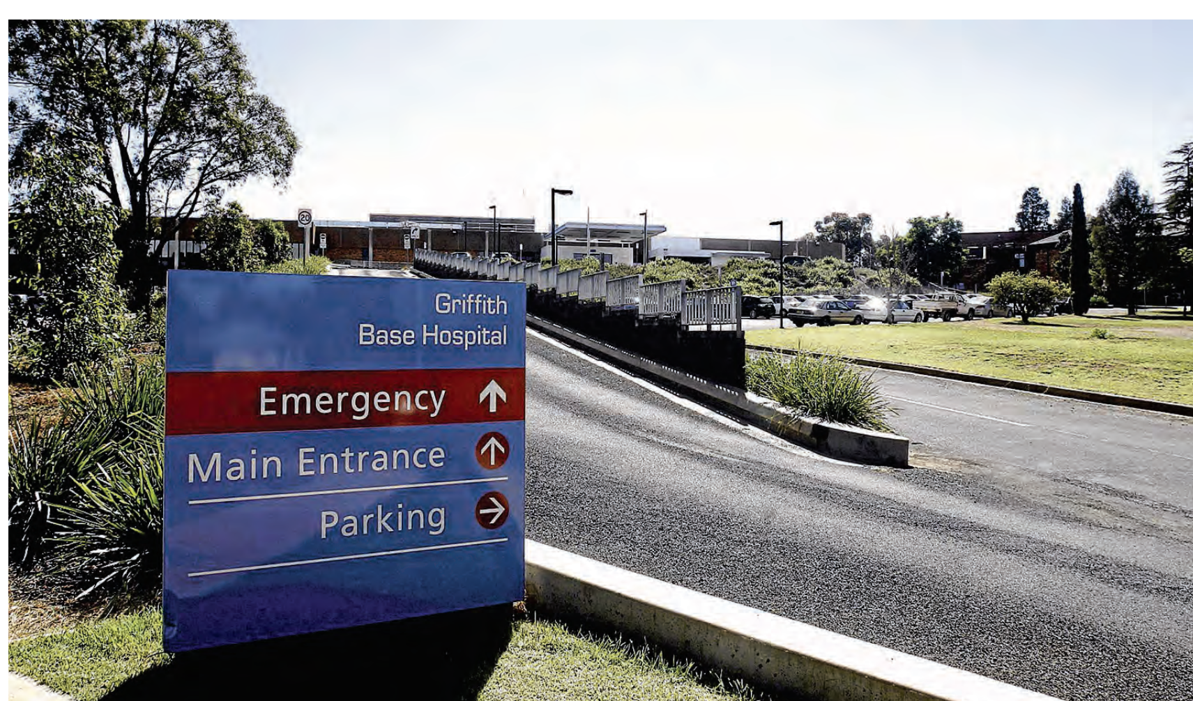
Griffith Base Hospital services 55,000 people in and around Griffith.