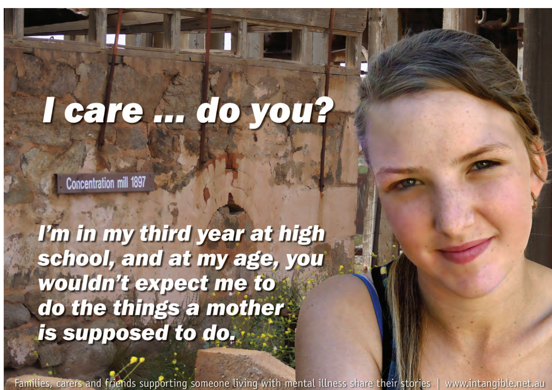
Some of the Intangible resources