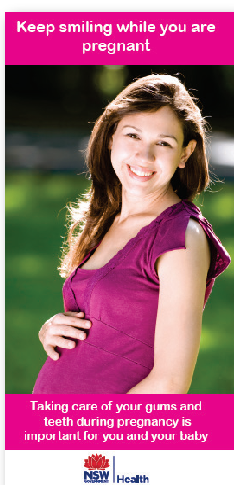
Pregnancy oral health brochures