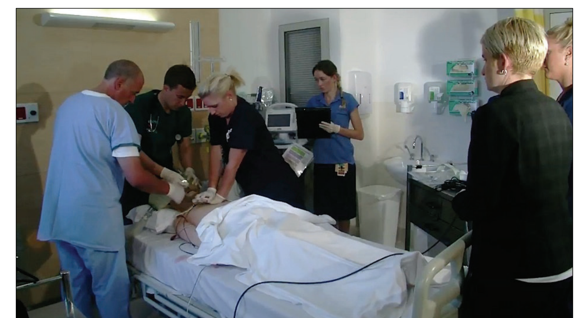
Chapter 9 Code Blue – Expected local application of the BLS/ALS algorithms are demonstrated