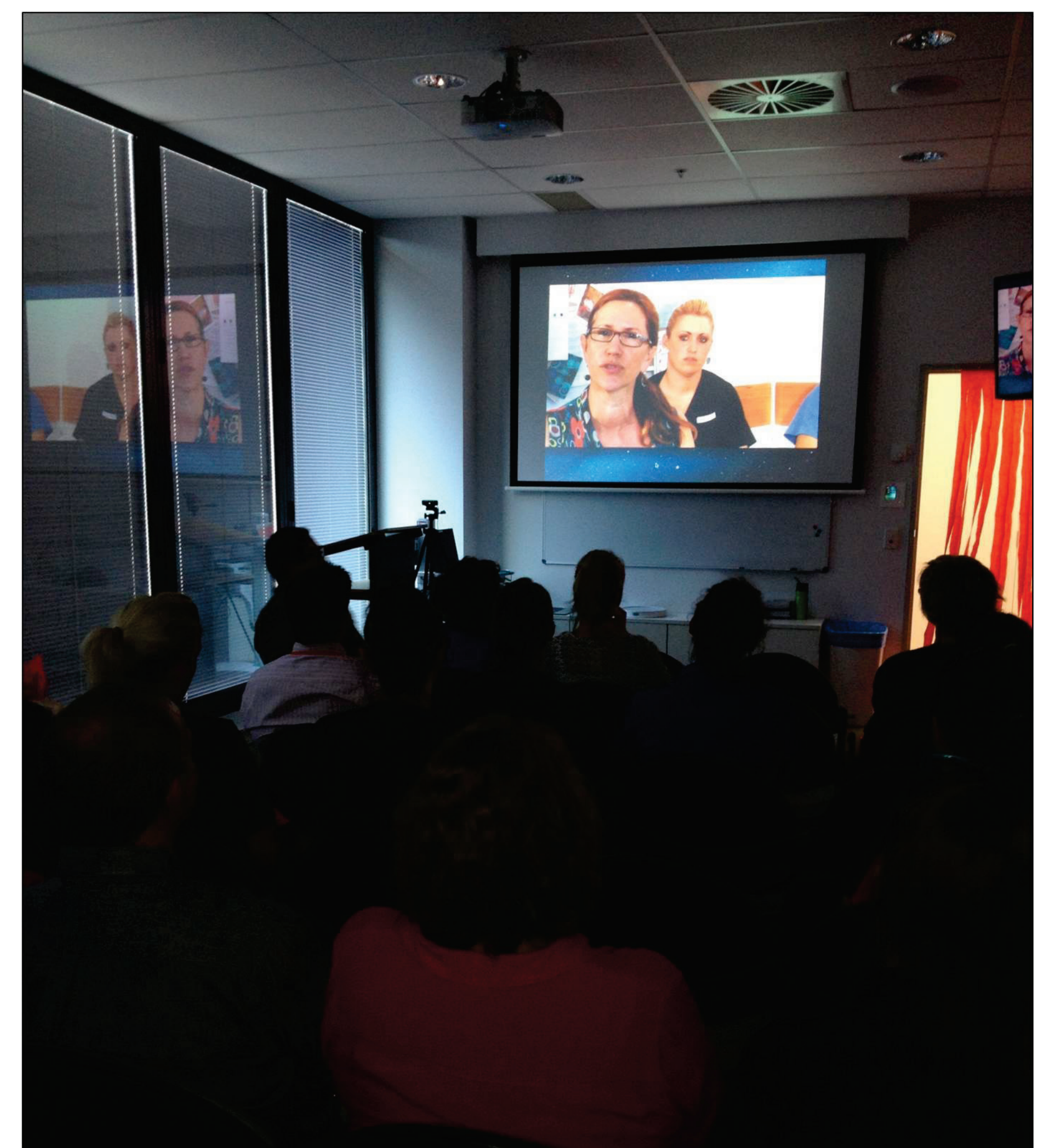
A premiere screening took place in two large conference rooms in the ICU, complete with invitations, red carpet and popcorn

The project demonstrates CORE values: Collaboration – the film making cemented relationships between executives, managers, nurses and doctors of all levels Openness – cast and crew worked as equals, inviting essential input and feedback Respect – there was recognition and valuing of the diverse talent of individuals Empowerment – all involved were energised to be role models and have been leaders of change