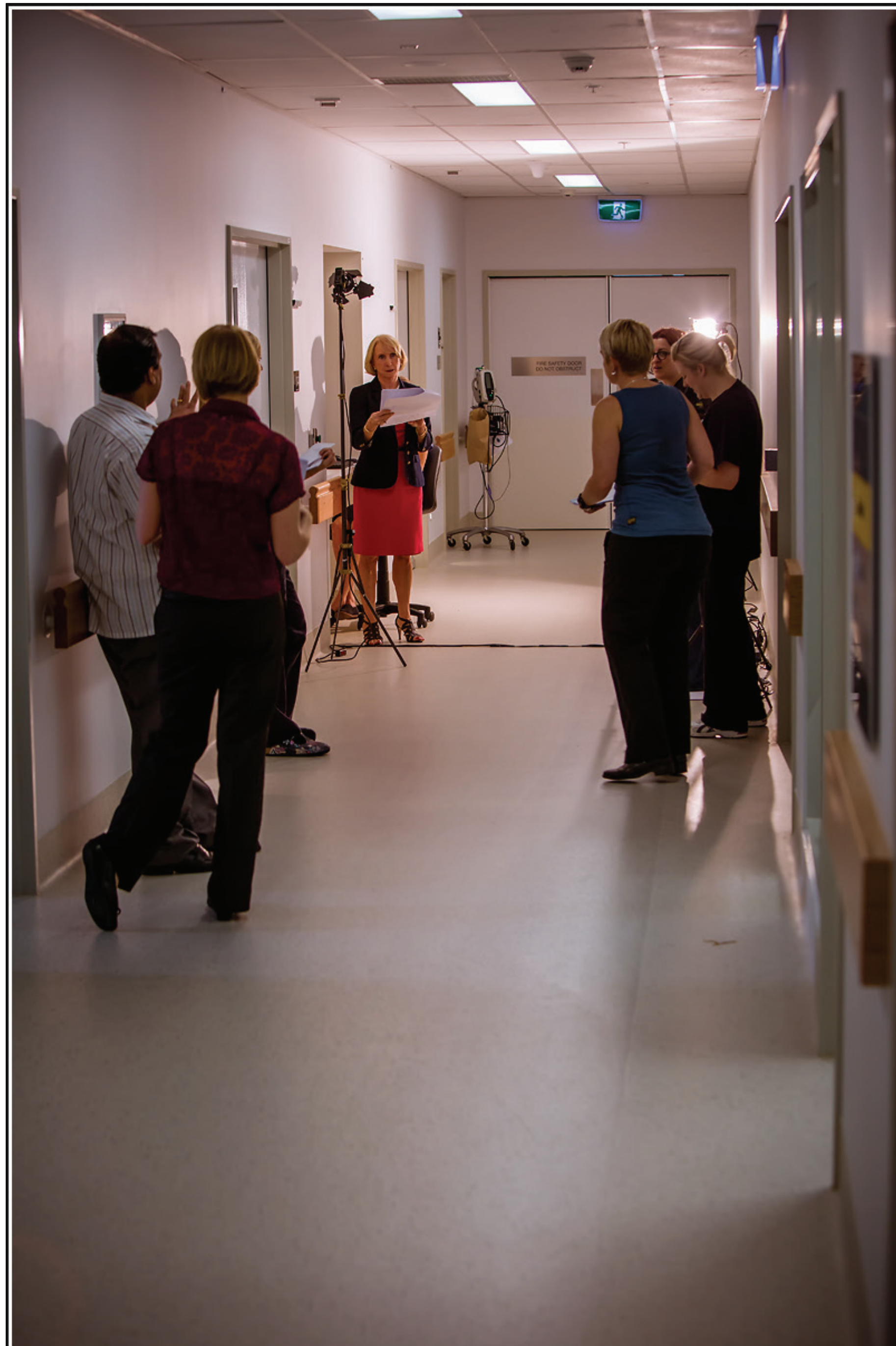
Ward 6B volunteered to be the set for the film shoot

Script development, set design, sound, lighting, cinematography and post-production development were done entirely with the talents and goodwill of team members without a specific budget.