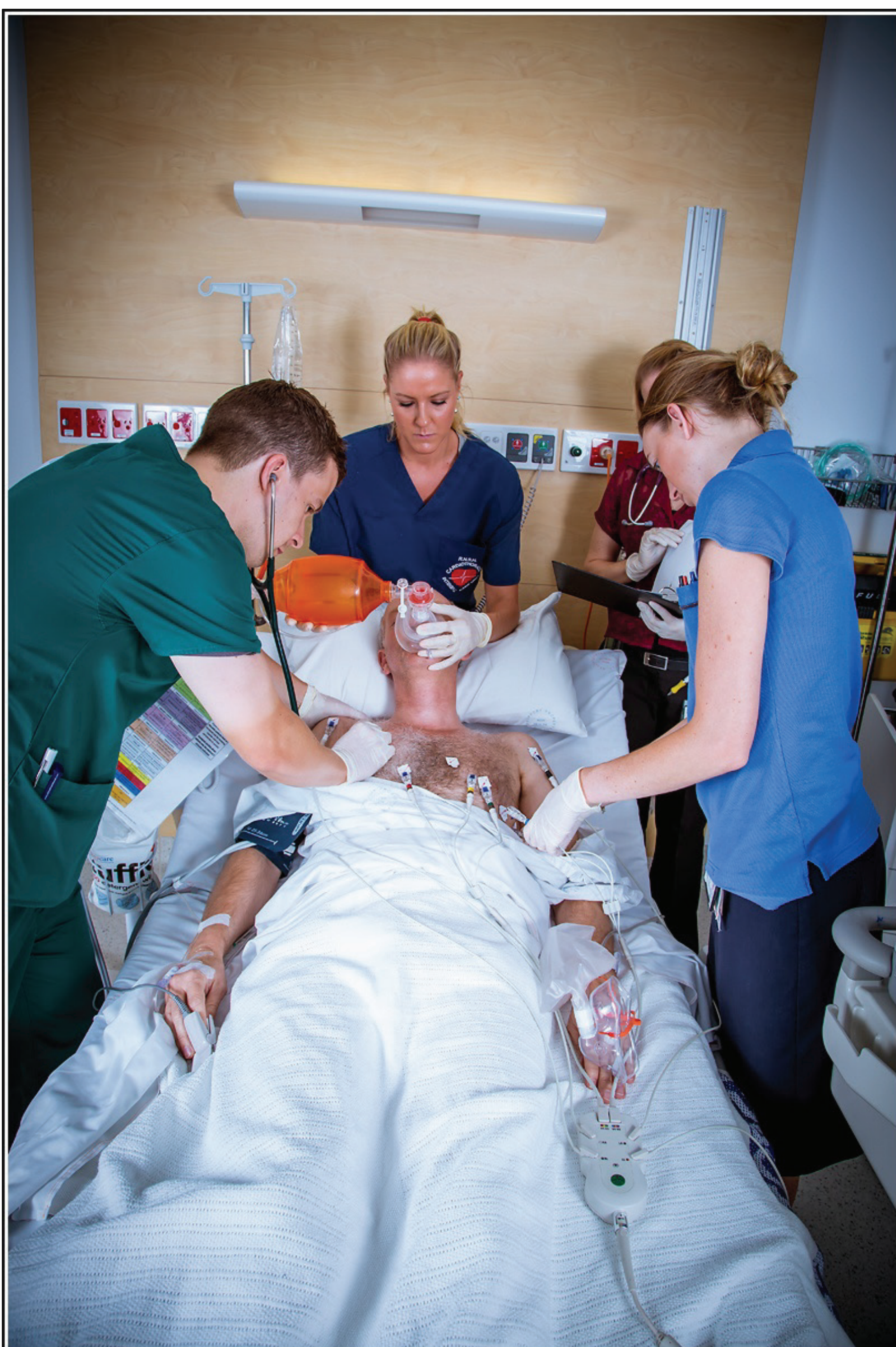
Chapter 8 RRT Review – Expectations of the ward & RRT responders are outlined

A plan for improving clinical outcomes for clinically deteriorating patients was developed. It centred on education of the entire hospital workforce using short films created for the people, by the people of Royal North Shore Hospital (RNSH).