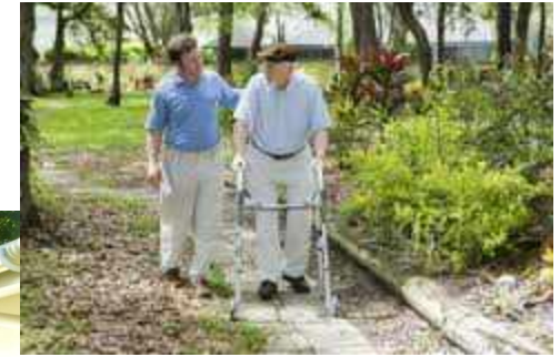
Coordinated integration with community services