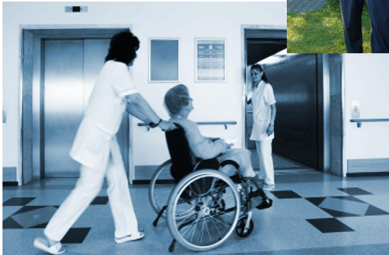
Care in the most appropriate setting