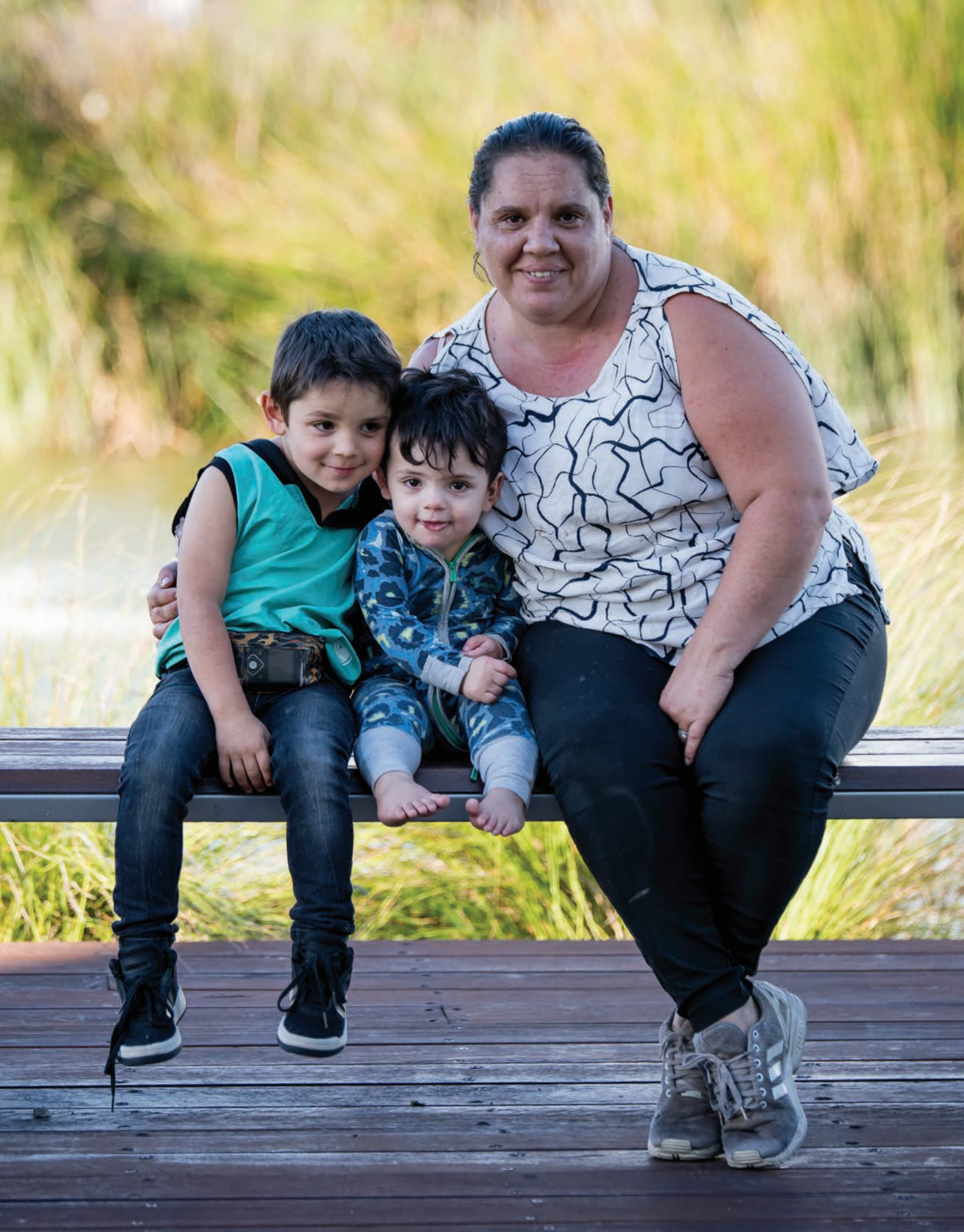
Aboriginal family living locally on Darug land in the Nepean Blue Mountains PHN region.