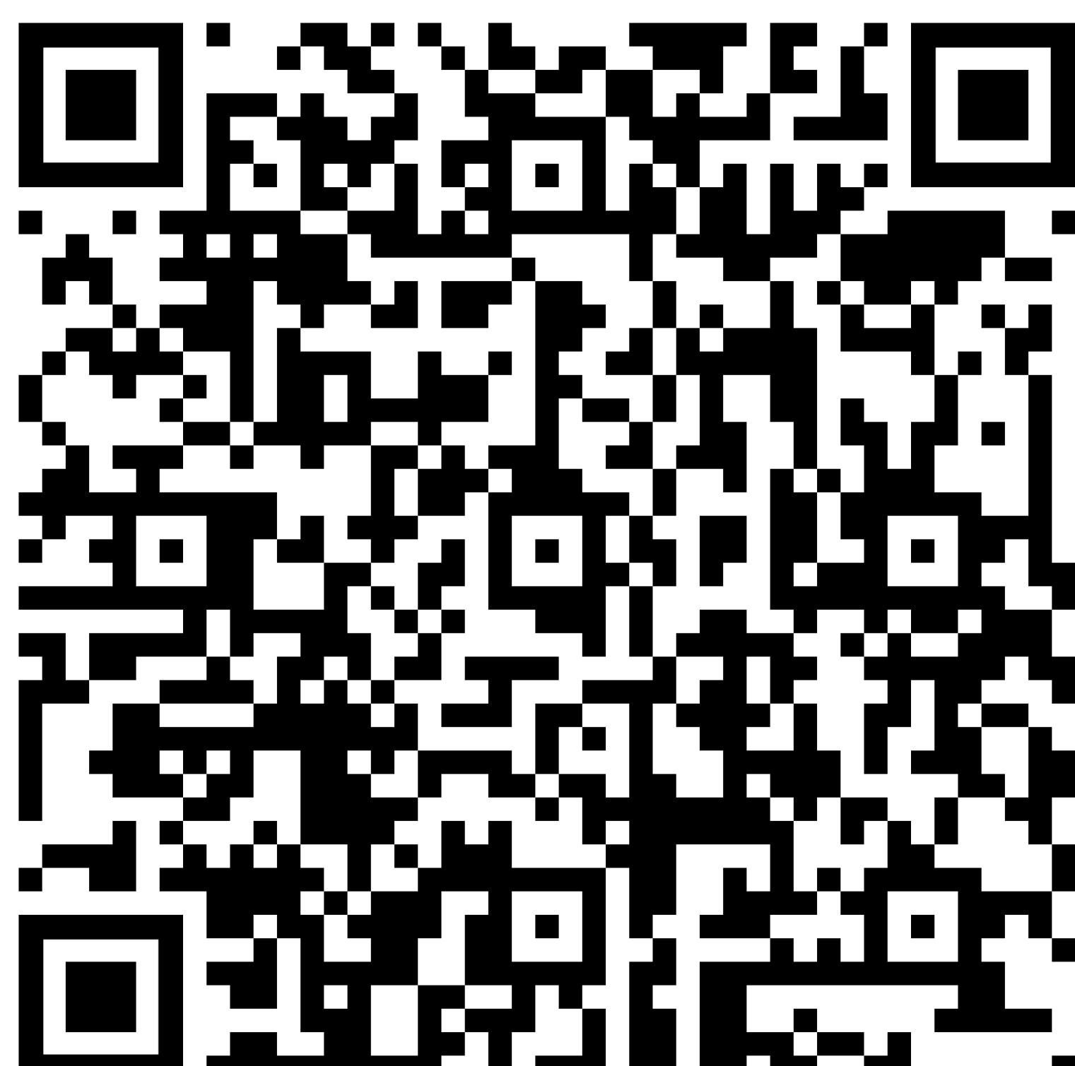
Parent Education Video Views June 1st - Sept 9

Please scan QR code to see the website and new resources