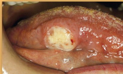
Cancer of the Tongue