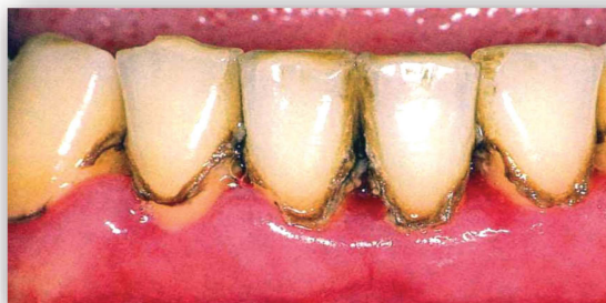
Stained Smoker's Teeth