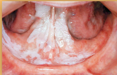
Changes that are reversible