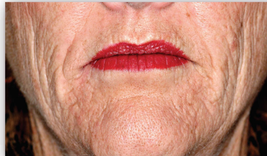
Premature ageing in a 45 year old smoker