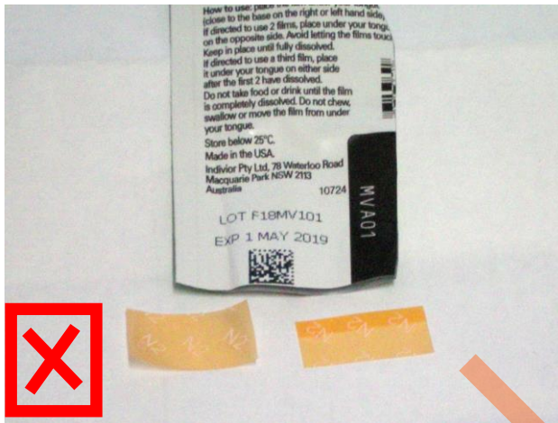
Figure 1. Full sheet of Suboxone® Film 2/0.5 mg (left) with an additional abnormal film (right) within a single sachet

Figures 1 and 2 are examples of potential abnormalities.