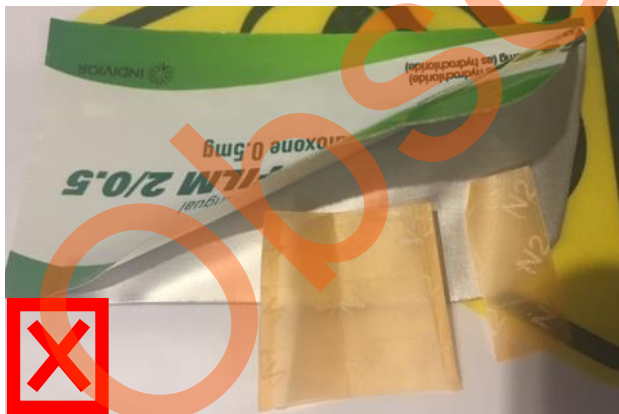
Figure 2. Two abnormal sheets of Suboxone® Film 2/0.5 mg within a single sachet