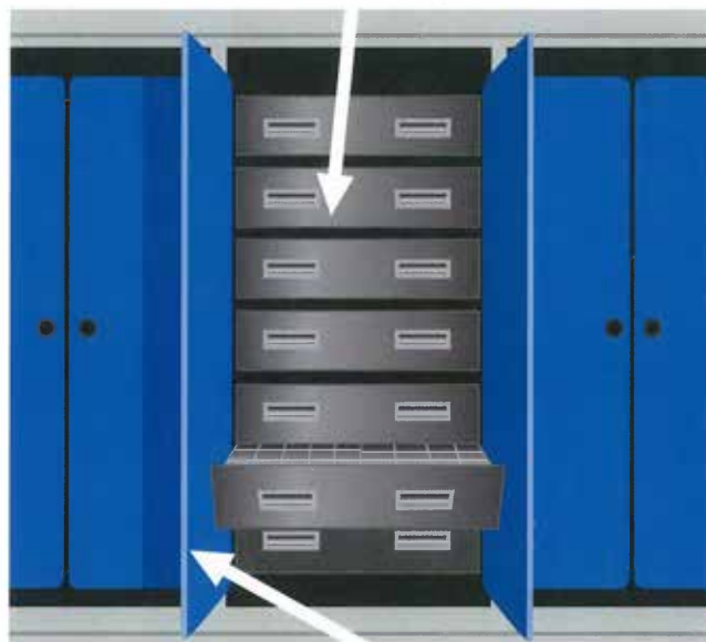
Spring loaded self closing doors

Note: The cupboard doors in this arrangement are not mandatory, however stores may wish to utilise these for lockable storage of tobacco or e-cigarette products