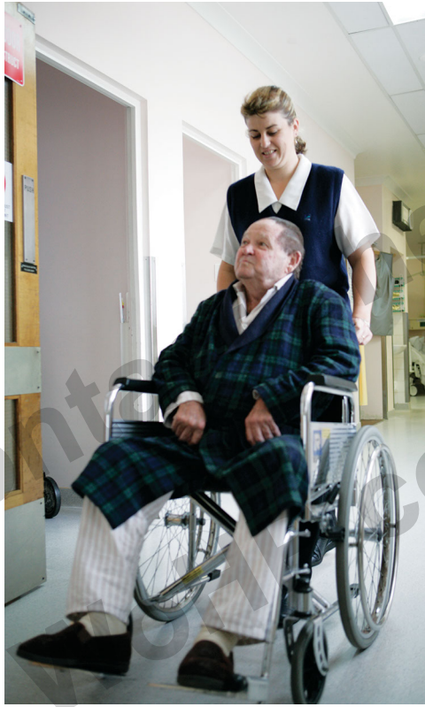
patient nurse 4