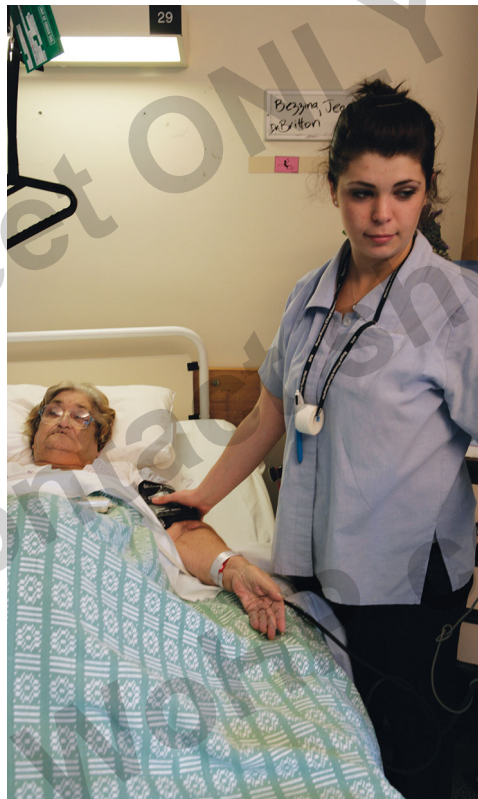
patient nurse 2