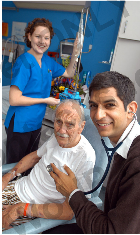
doctor nurse patient